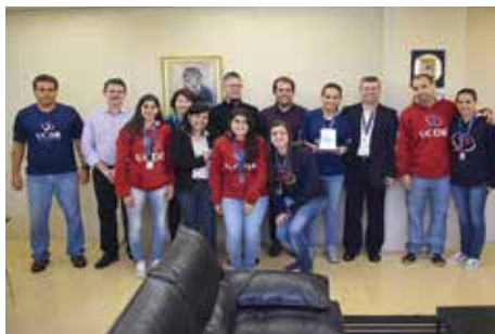
Woman's futsal athletes

Men's basketball and handball teams and woman's futsal team compete on the national round of the competition