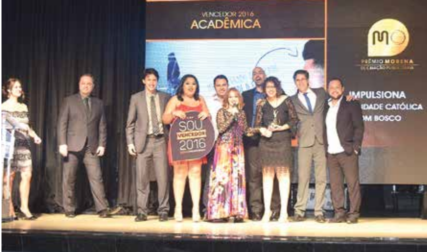
Academics and professors from Publicity and Advertising got the sixth trophy