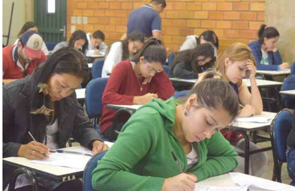
Registrations can be done on UCDB's website by June 22

On the on-site courses, except for Law, the vacancies for 2016B are remaining and the registrations are done in the second semester on the groups that started in 2016 a . The opportunities are for graduations in Administration, Agronomy, Analysis and Development of Systems,