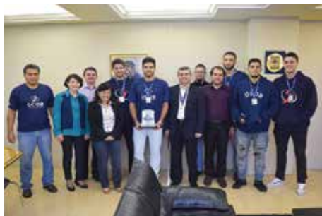
Men's basketball team