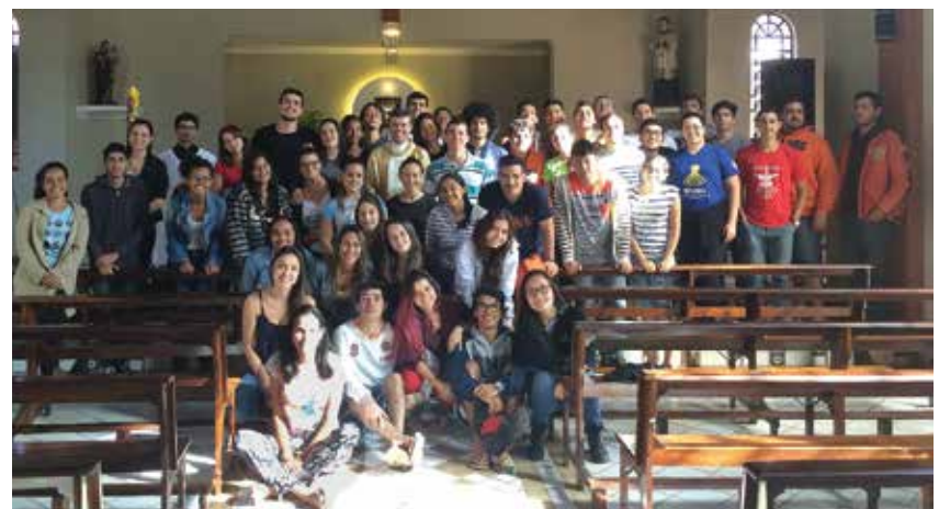
The Pastoral's Easter camp had the participation of 65 people. '

The Pastoral is an open space to everyone, during the morning, afternoon and night! Come visit us!