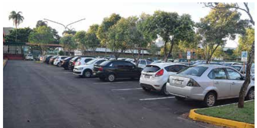
The special spots must be respected to avoid tickets and guarantee the accessibility

In order to park in reserved spots, elderly and people with physical disabilities must display their credential on the car's dashboard, where the agents are able to see. In Campo Grande, the registration to request the parking license for special spots can be done on the following website http://apl04.pmcg.ms.gov.br:8080/sigaweb/index.zul . UCDB is preparing an awareness campaign for all the drivers about the validity of the Law, to ensure the respect of the traffic rules.