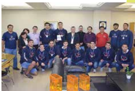
Men's handball team