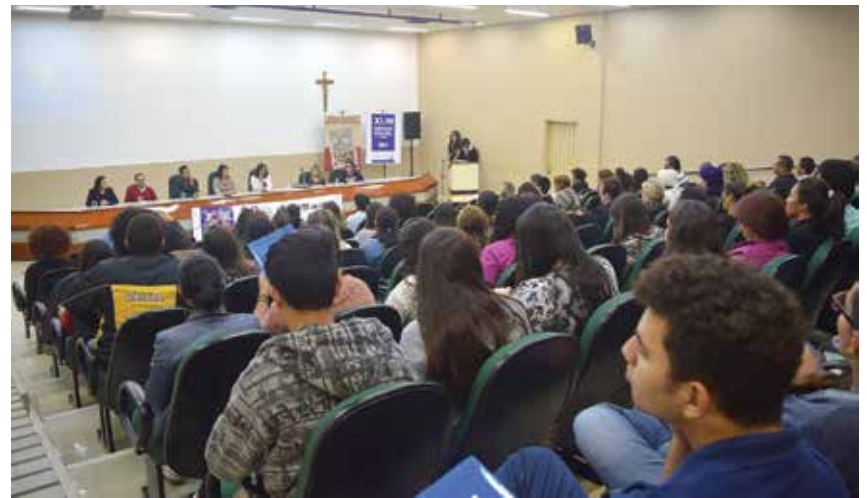
From May 17 to 19, the 43rd Social Service Week was held at UCDB

At UCDB, the course has been offered for 44 years, helping the improvement in the professional