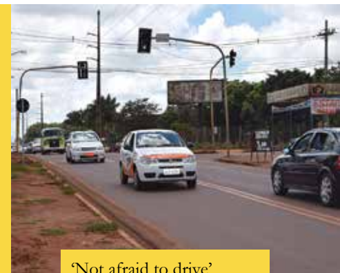
'Not afraid to drive' project is free of cost

To be part of it, the parties must be over 18 and sign up by phone (67) 3368-0161. A first meeting will be done and then the parties will be directed to