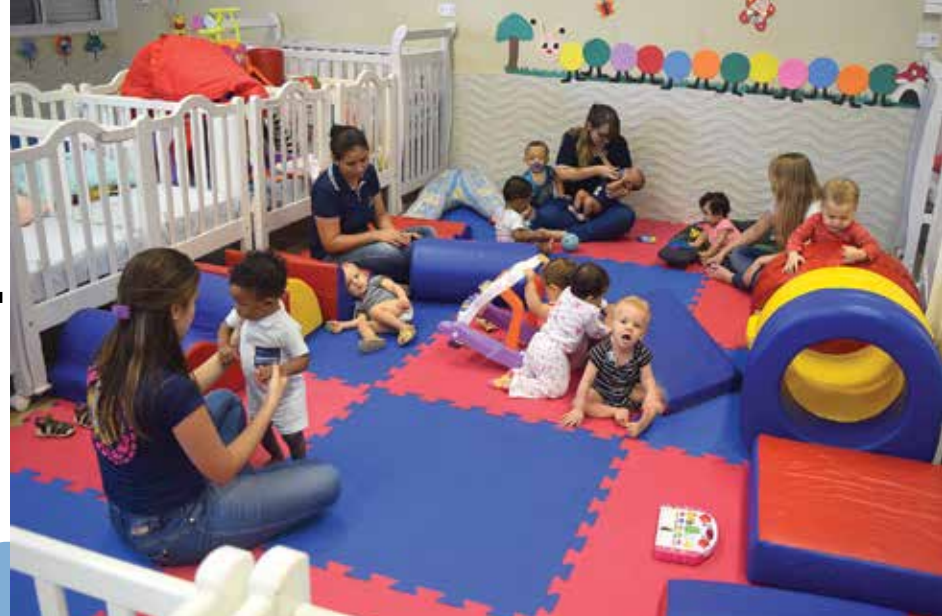
Internships can be done at UCDB, as is the case of the Early Childhood Center or in partner companies