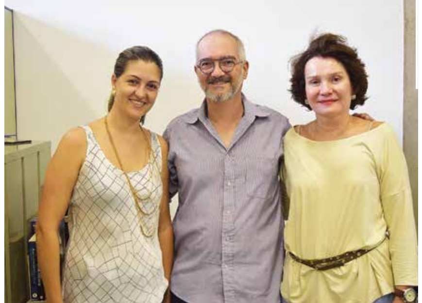
Humanities Laboratory Researching Participants

The Humanities Laboratory works in four different areas: