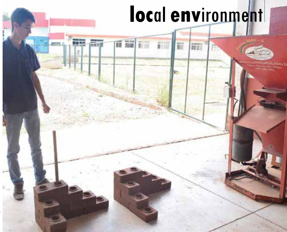
Student shows the production of ecological bricks with the use of a machine donated by Semadur