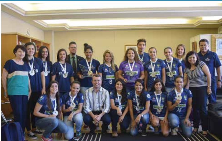
The medalists from JUBs took part in the meeting with the Rector and Pro-Rectors of UCDB