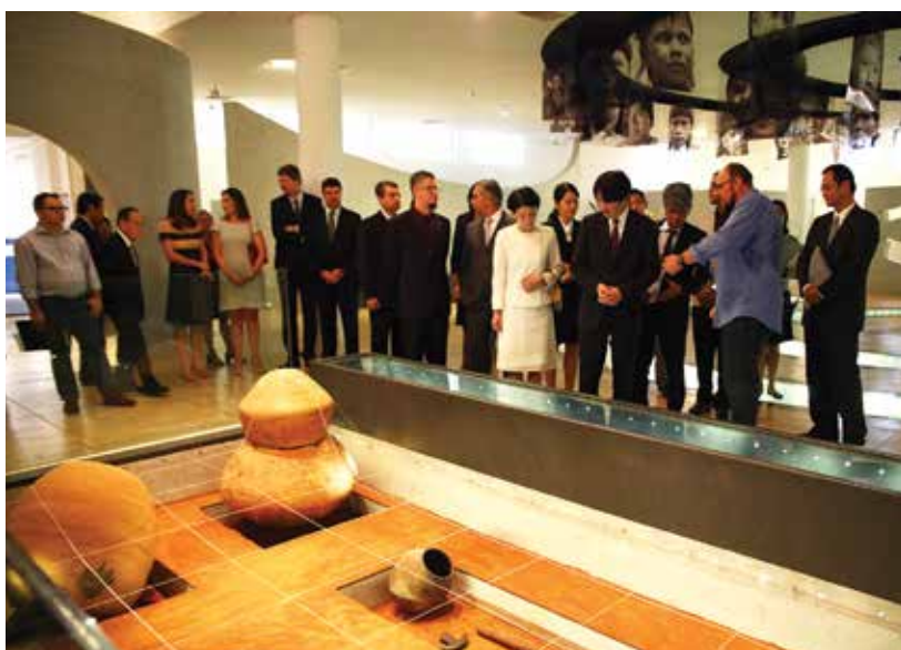
Japanese visitors were accompanied by the Governor and Secretaries