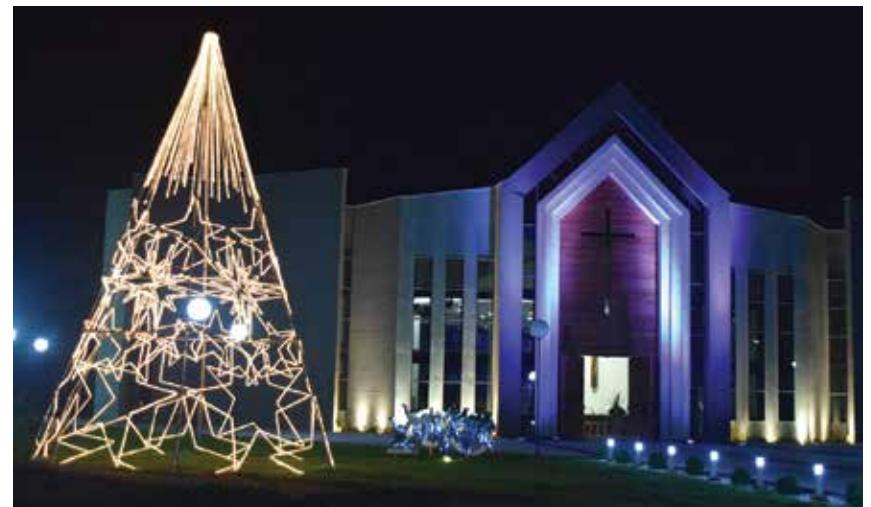
Masses on Sundays start at 7:15pm at UCDB

Since the Foundation of the Institution (1993), traditional masses were held in chapels or in the amphitheatre. The Church, which is located between blocks A and C, shelters up to 520 people. More information can be obtained by calling (67) 3312-3429.