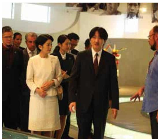
Princess Kiko and Prince Akishino