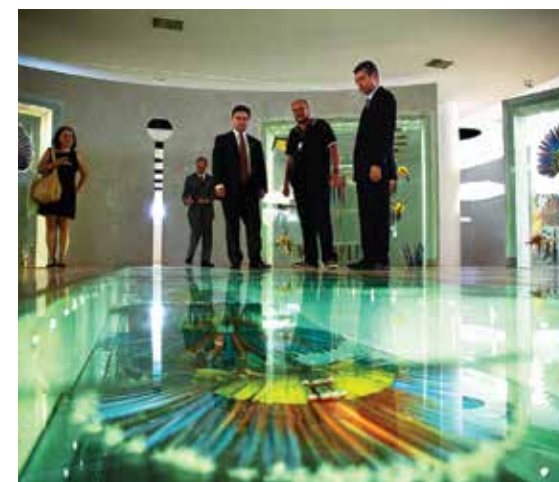
Ethnological artifacts delighted visitors