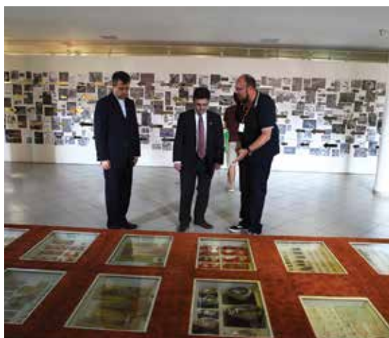
Passage of the Consul by the entomological collection

Museu das Culturas Dom Bosco receives, every year, over 12 thousand people, mostly children. The site is open from Tuesday to Sunday, from 8:00am to 4:45 pm.