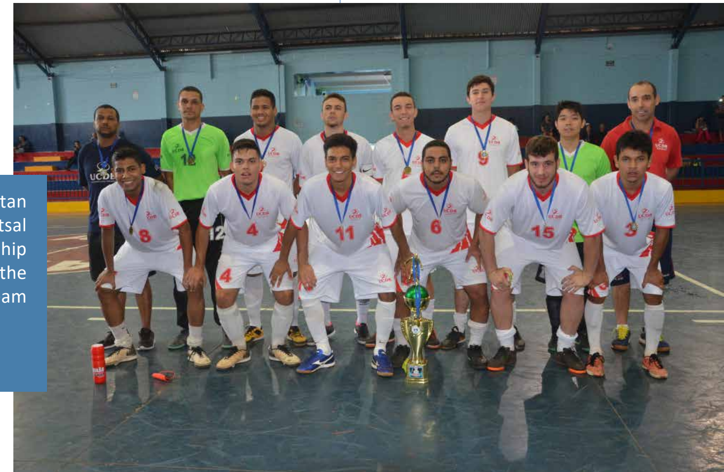
Metropolitan Men's Futsal Championship was won by the Catholic team