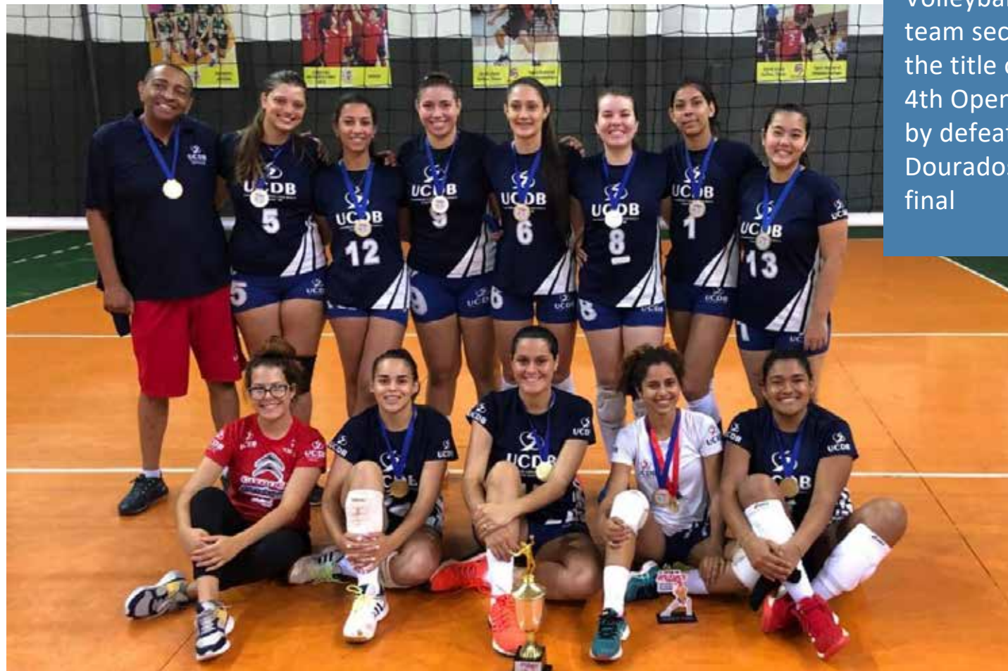
Volleyball team secured the title of the 4th Open Cup by defeating Dourados in the final

6, in Campo Grande. The UCDB volleyball athletes played against "Dourados", at the El Kadri gym, and won by two sets to zero. The men's futsal team, on the other hand, faced the "Meninos da Vila" team, at Colégio ABC's gymnasium, and guaranteed a 2-0 victory.