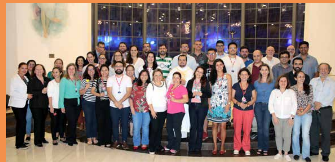
Tributes took place after the masses in commemoration of Teacher's Day, at the São João Bosco University Parish, with the presence of the Catholic faculty