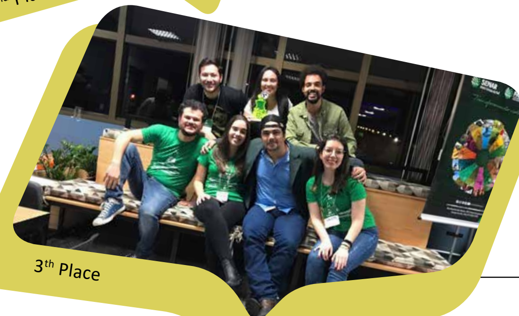
3 th Place