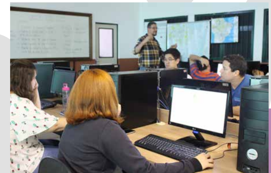
Course on the new software was carried out at UCDB

and academic studies of undergraduate courses (Sanitary and Environmental Engineering, Civil Engineering, Agronomy, Biology and Architecture) and stricto sensu postgraduate studies (Environmental Sciences and Agricultural and Livestock Sustainability and Local Development) . “In addition to preparing the student to use a modern program, many scientific works may result from these analyzes obtained with the software”, he said. This month, a training course was held at UCDB with the participation of technicians from municipal and state bodies (Imasul, Agesul, Planurb, City Council, PMA, Sedesc, Fire Brigade and Military Police).