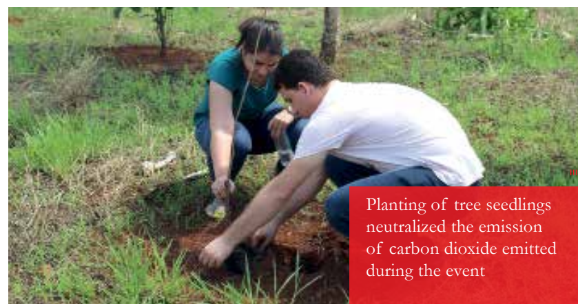
Planting of tree seedlings neutralized the emission of carbon dioxide emitted during the event