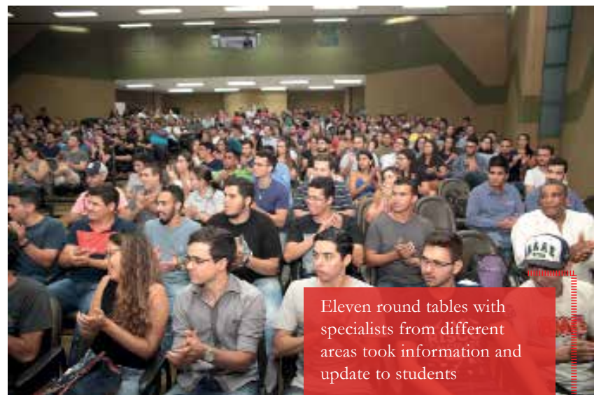
Eleven round tables with specialists from different areas took information and update to students