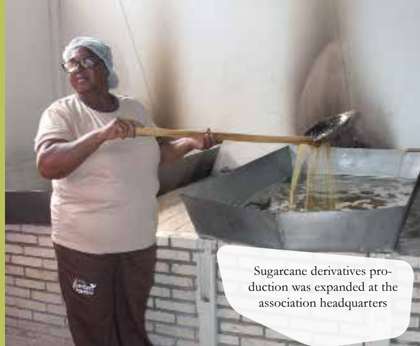
Sugarcane derivatives production was expanded at the association headquarters