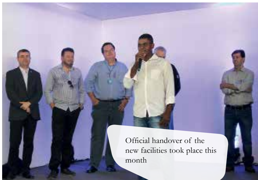
Official handover of the new facilities took place this month

On November 9th, during the inauguration, the governor also presented the architectural project of a farinha, a new space that is going to be used for the production of cassava flour, one of the products made by the community. 90 quilombola families will be benefited.