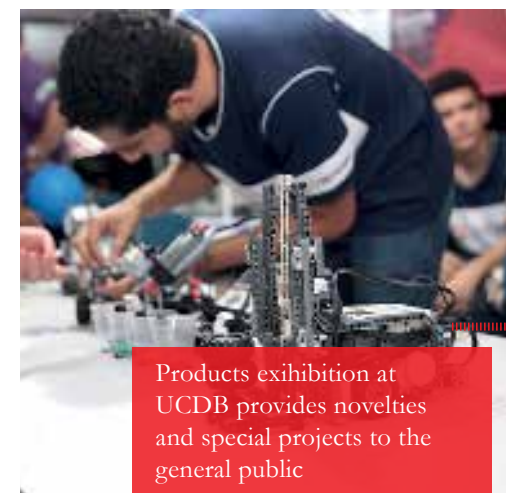
Products exhibition at UCDB provides novelties and special projects to the general public