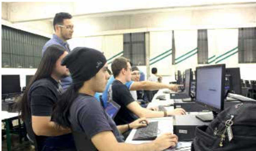
In the project, academics work hard coming up with solutions for companies