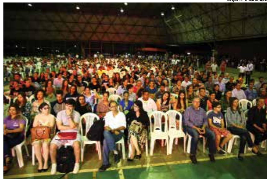
Opening of the event will be on the sports courts

In block C, on the top floor, from 8 am to 21h, Cultural Labyrinth will be open to the public, as in blocks A and B, there will be temporary exhibitions. Also in block A, at the same time, Fair Internships and Cultural