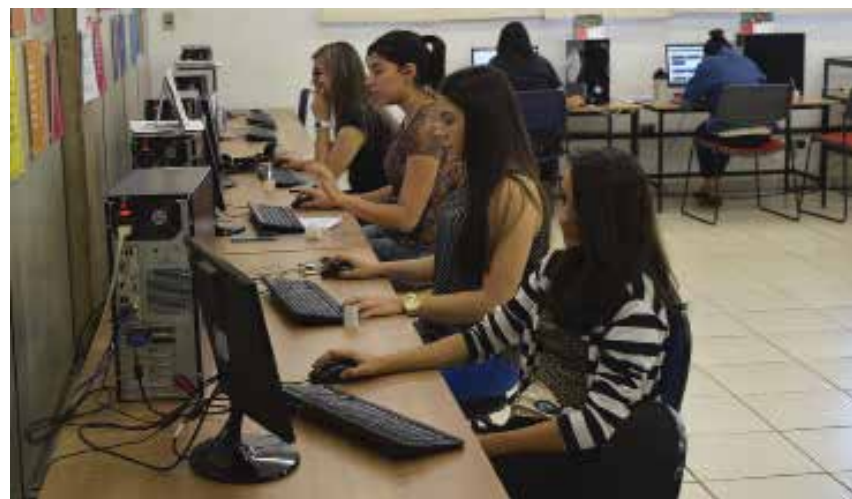
Students put into practice the theory learned in the classroom