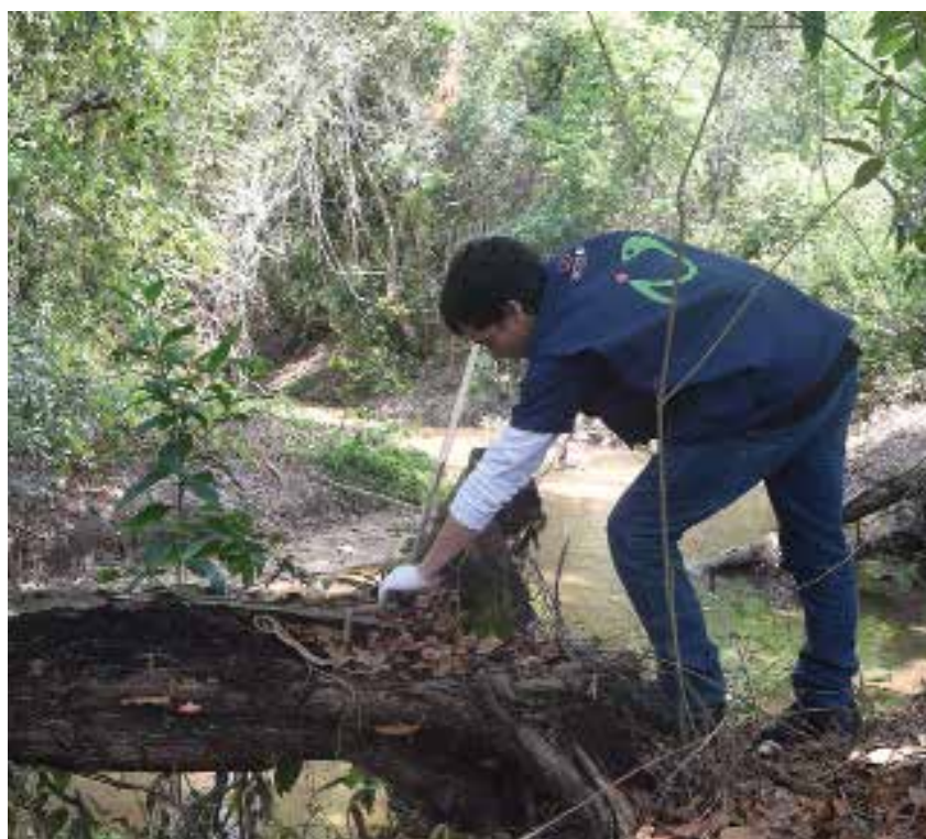
Snakes that are not poisonous receive a chip monitored and returned to nature

in the region. In addition to being more effective, it ensures that the transport and storage conditions are ideal for the product. Currently, the distribution of antivenom demands a large logistics, as part of the South East to other regions of the country", explained Paula.