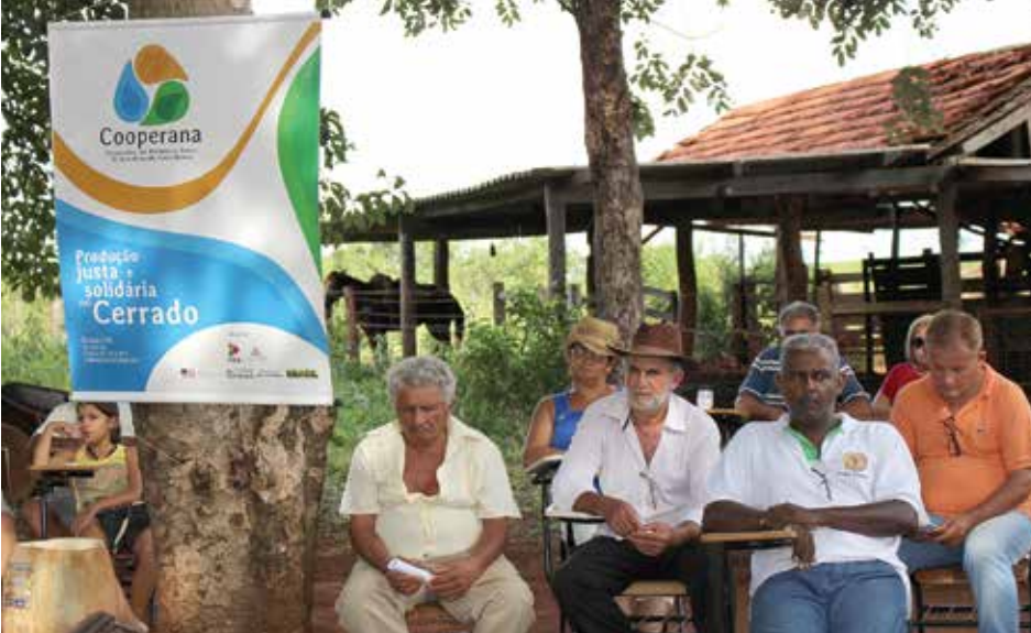
Producers in Terenos