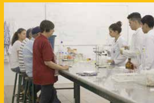
Energy bar recipe was developed from CeTeAgro laboratory of UCDB

“The bars, along with what we have already marketed, will