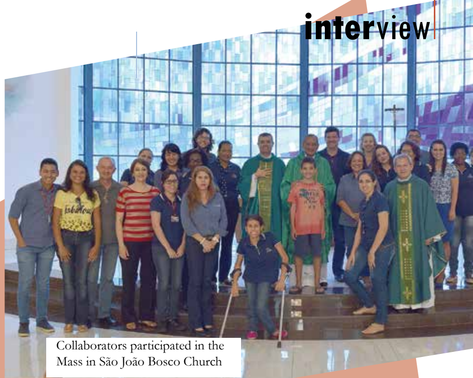
Collaborators participated in the Mass in São João Bosco Church

fr. Pascual: Brazil, in the first place, has a very rich presence of the Salesian charism. A part of the very strong work is the Don Bosco Museum of Cultures, is an example of everything that is carried out here. Fundamentally, there are two typically visionary provinces in the country: Manaus and Campo Grande, with valuable works developed with indigenous groups, to provide knowledge of cultures and language learning - these are very important from the point of view of anthropology cultural. The Salesians have also developed an educational work very well in Brazil, from nursery schools to colleges and vocational training centers. The UCDB campus in Campo Grande is one of the emblems of the Brazilian Salesian presence in the field of formal education. In addition, in the country we have the presence of social assistance for the most abandoned young people with