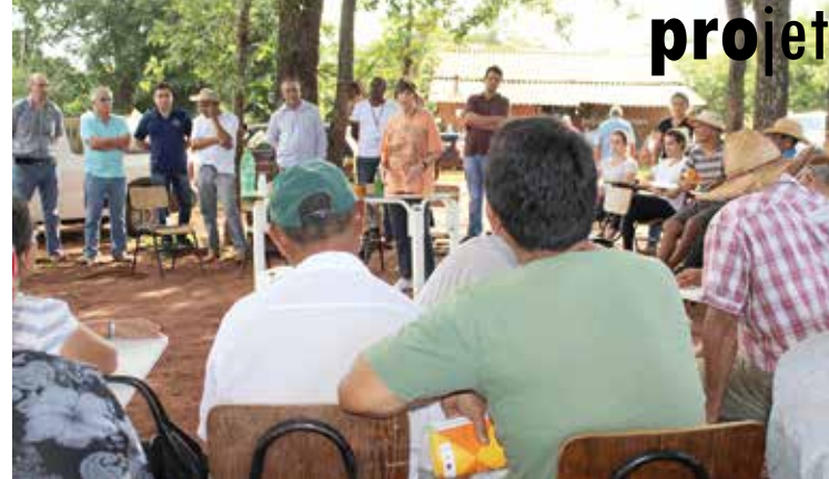
Settlers attend a meeting with UCDB and Banco Santander representatives